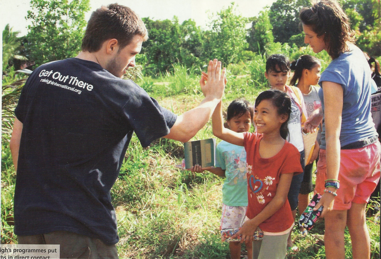
Raleigh's programmes put youths in direct contact with local communities and the great outdoors