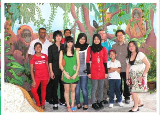
LAUNCH OF THE INTERNATIONAL ORANG-UTAN AWARENESS WEEK. THANK YOU TO ALL STAFF AND STUDENTS WHO WERE INVOLVED!