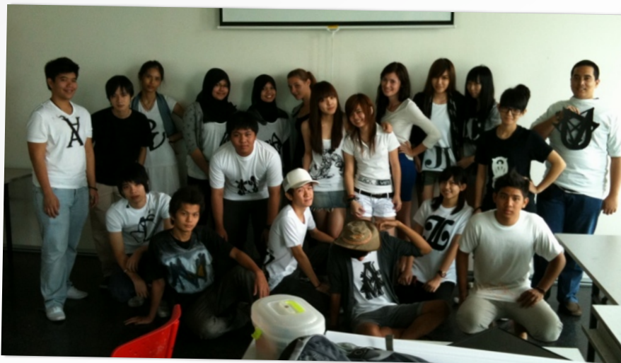
SEMESTER 1 DIPLOMA IN GRAPHIC COMMUNICATION AND MULTIMEDIA DESIGN STUDENTS

to deal with industry project briefs, the students realised that design makes a difference in wildlife protection and society. Apart from the mural, the students also raised RM700 Ringgit by selling postcards which they designed and some merchandise which goes to W-O-X Orang-Utan project.